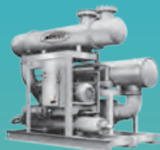
High Capacity Dryers