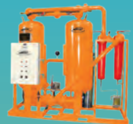
Desiccant Dryers Heatless & Heated