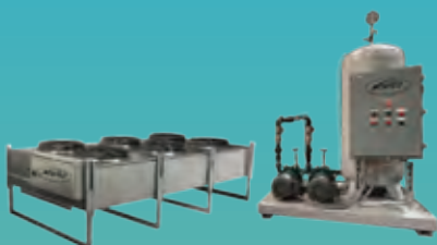
Water Saver and Pumping Stations