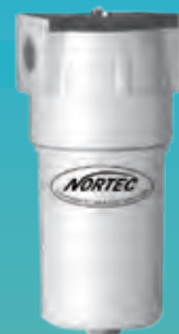
Liquid and Cyclone Separators